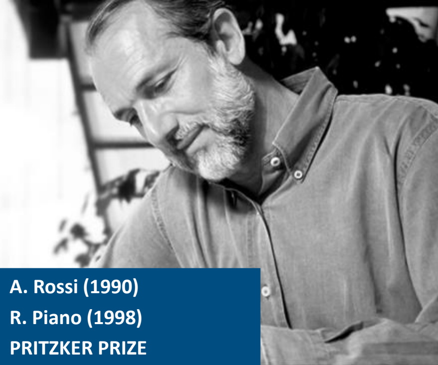
A. Rossi (1990) R. Piano (1998) PRITZKER PRIZE THE “NOBEL PRIZE” OF ARCHITECTURE