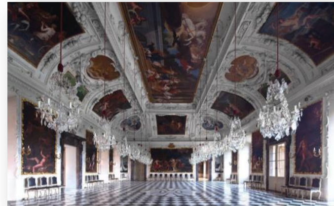
Schloss Eggenberg, Planetary Room