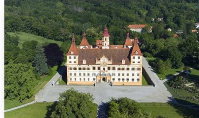
Schloss Eggenberg castle and gardens